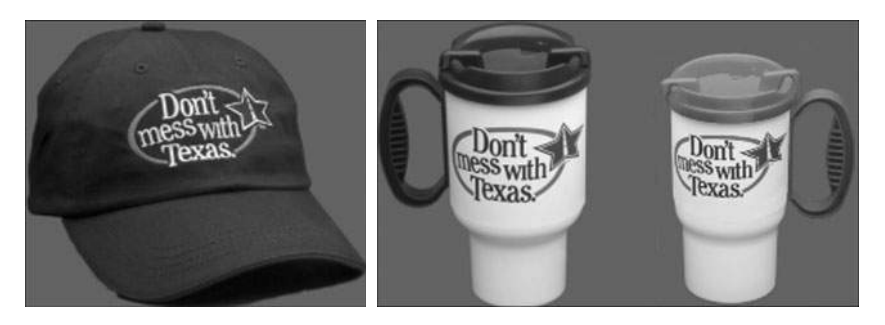
FIGURE 6.13 A portion of Don't Mess with Texas merchandise sales help fund the "Don't Mess with Texas" litter prevention campaign

Most importantly, the brand supports the state's objectives to reduce littering. In less than ten years following the launch of the campaign, litter on Texas roadways was reduced by 52 percent. Perhaps the fact that in 2005 the Texas Department of Transportation began cracking down on unauthorized use of the slogan and logo is one additional indicator of the brand's evolution.