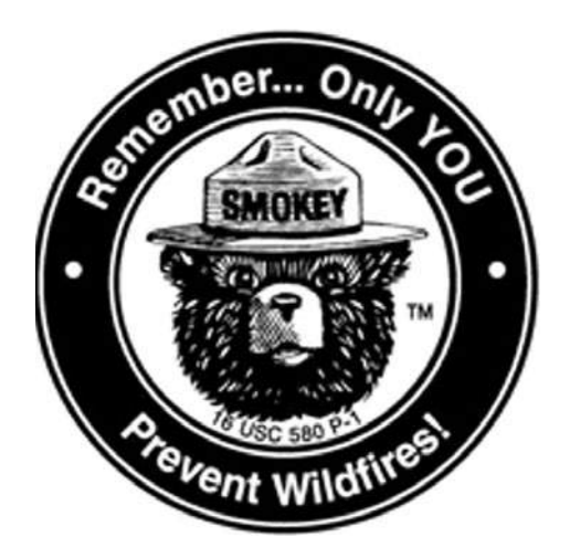
FIGURE 6.5 Image and slogan used in 2005

By 1952, the Smokey Bear symbol began to attract commercial interest, enough so that legislation was passed to take Smokey out of public domain and place him under the control of the Secretary of Agriculture. An amendment in 1973 offered commercial licensing and directed that fees and royalties were to be used to promote forest fire prevention. Hundreds of items have been licensed under this authority over the years, several featured in Smokey's "Museum" on his official Web site SmokeyBear.com.