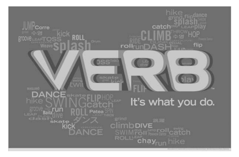
FIGURE 6.8 Tweens are encouraged to "pick their verb"

positioning. Kotler and Keller have identified six major factors to guide these selections, ones that can be used to evaluate a pool of options, testing them with target audiences relative to these ideals:<sup>14</sup>