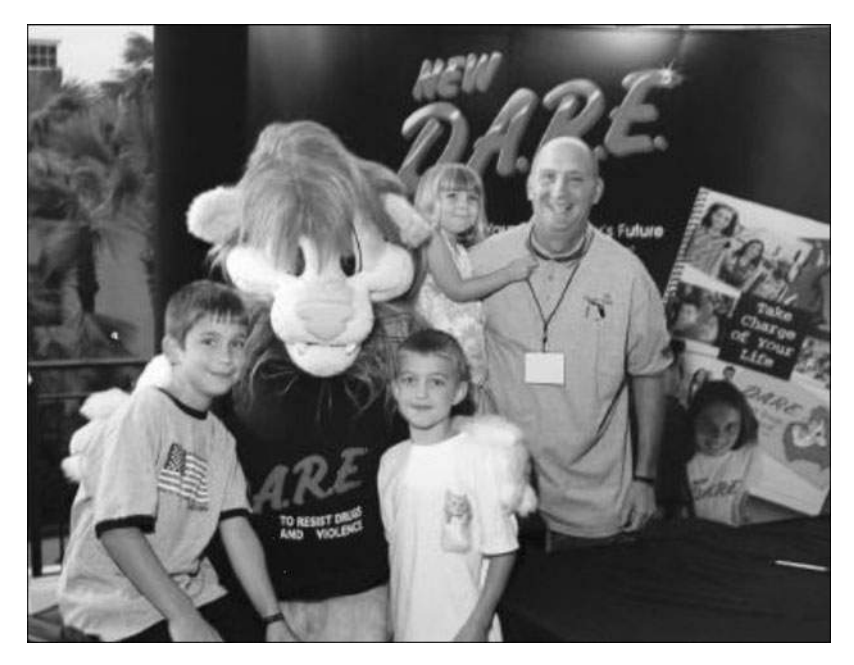
FIGURE 6.15 Promoting the revitalized D.A.R.E. program<sup>27</sup>

Your Mind. One of the inspirational stories they share is of their involvement in helping to position the island of Jamaica as a premier destination for tourists.