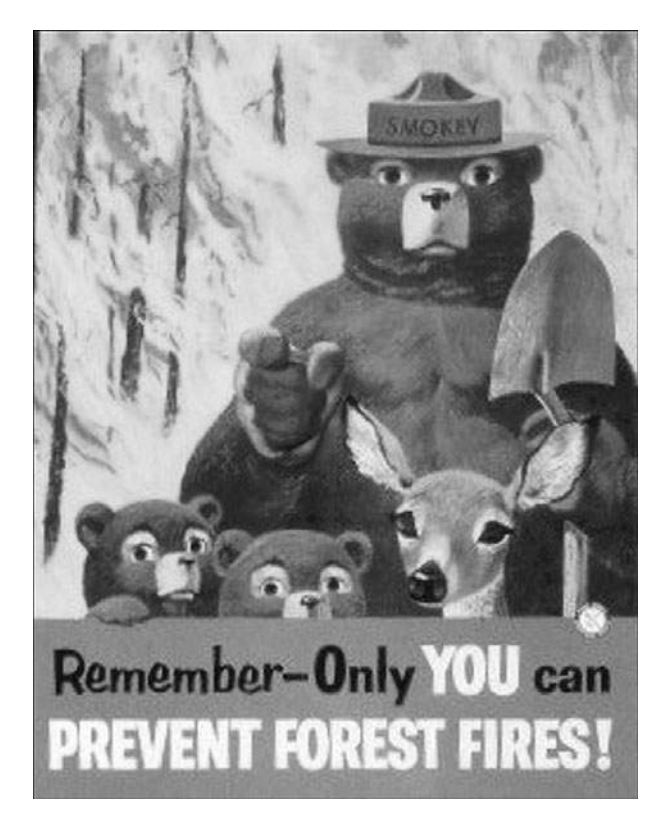
FIGURE 6.4 Poster used in 1948

The guardian of forests in the U.S., and one of the world's most recognizable fictional characters, has been a part of the American scene for more than sixty years. Smokey Bear, dressed in a ranger's hat and belted blue jeans and carrying a shovel, has been the recognized wildfire prevention symbol since 1944 (see Figure 6.4). The slogan "Only YOU Can Prevent Forest Fires" was first used in 1947 and was only changed slightly in 2001 when his message was updated to "Only YOU Can Prevent Wildfires" to address the increasing number of wildfires in the nation's wildlands (see Figure 6.5).