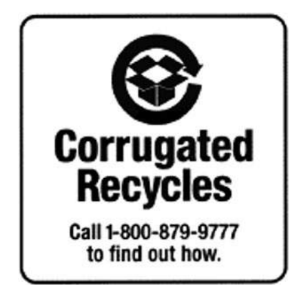
FIGURE 6.10 Extending the recycle symbol to specific materials

One campaign that has made great choices regarding brand elements to achieve these ideals is the tough-talking litter prevention campaign