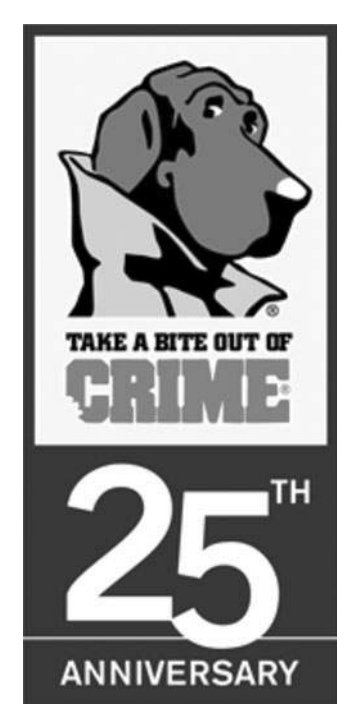
FIGURE 6.14 McGruff the Crime Dog<sup>®</sup> helping Americans "Take A Bite Out of Crime"<sup>® 23</sup>

National Crime Prevention Council, a private nonprofit organization, serves as the day-to-day manager of the campaign, which is funded through a variety of government agencies as well as corporate and private foundations and donations from private individuals. It is one of the most successful public service campaigns in history, with a recent identity theft initiative funded by the Department of Justice to help consumers take practical steps to protect their personal information.