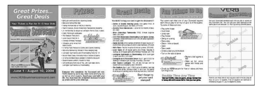
FIGURE 6.7 Campaign material used in Lexington, Kentucky highlighting the brand promise