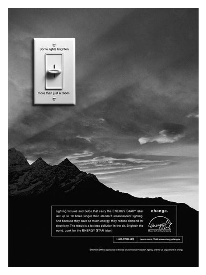
FIGURE 6.1 Print PSA for ENERGY STAR

will focus on strategies to engage the loyal consumers of ENERGY STAR to help advocate for the brand to their friends and families.