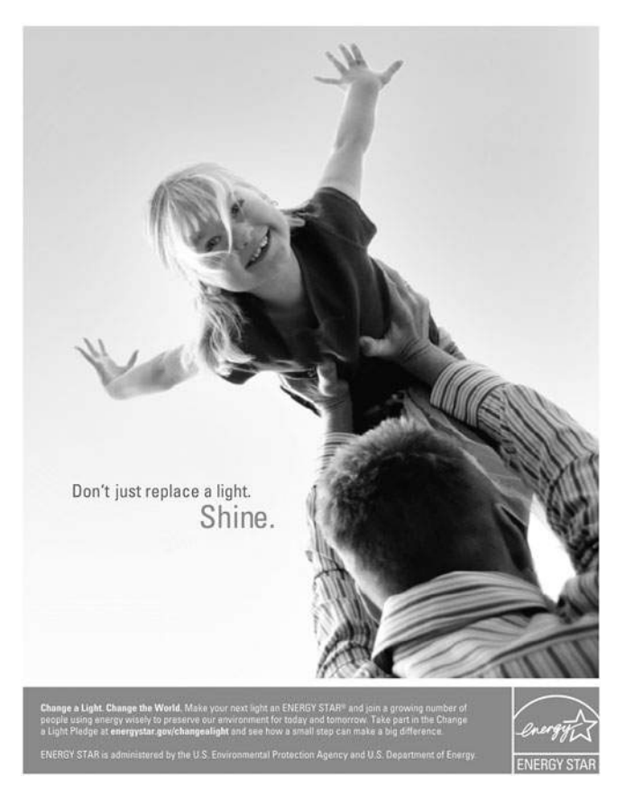
FIGURE 6.2 A campaign pairing up the U.S. Environmental Protection Agency with the Department of Energy